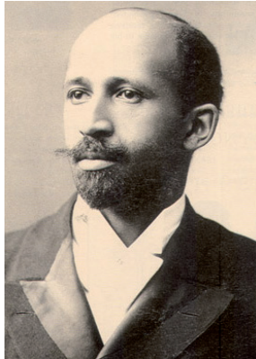
W.E.B. Du Bois (1868-1963), U.S. American scholar, author and civil rights leader. Ph.D. Student at Berlin University (now Humboldt-Universität zu Berlin) from 1892-94. The W.E.B. Du Bois Lectures are named in his honor.

Our close collaboration with several U.S.-American universities, among them New York University, the University of Washington and the University of Minnesota, is a valuable asset in facilitating transatlantic academic exchanges both on student and faculty levels.