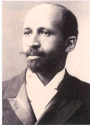
W.E.B. Du Bois (1868-1963), U.S. American scholar, author and civil rights leader. Ph.D. Student at Berlin University (now Humboldt-Universität zu Berlin) from 1892-94. The W.E.B. Du Bois Lectures are named in his honor.

Our close collaboration with several U.S.-American universities, among them New York University, the University of Washington and the University of Minnesota, is a valuable asset in facilitating transatlantic academic exchanges both on student and faculty levels.